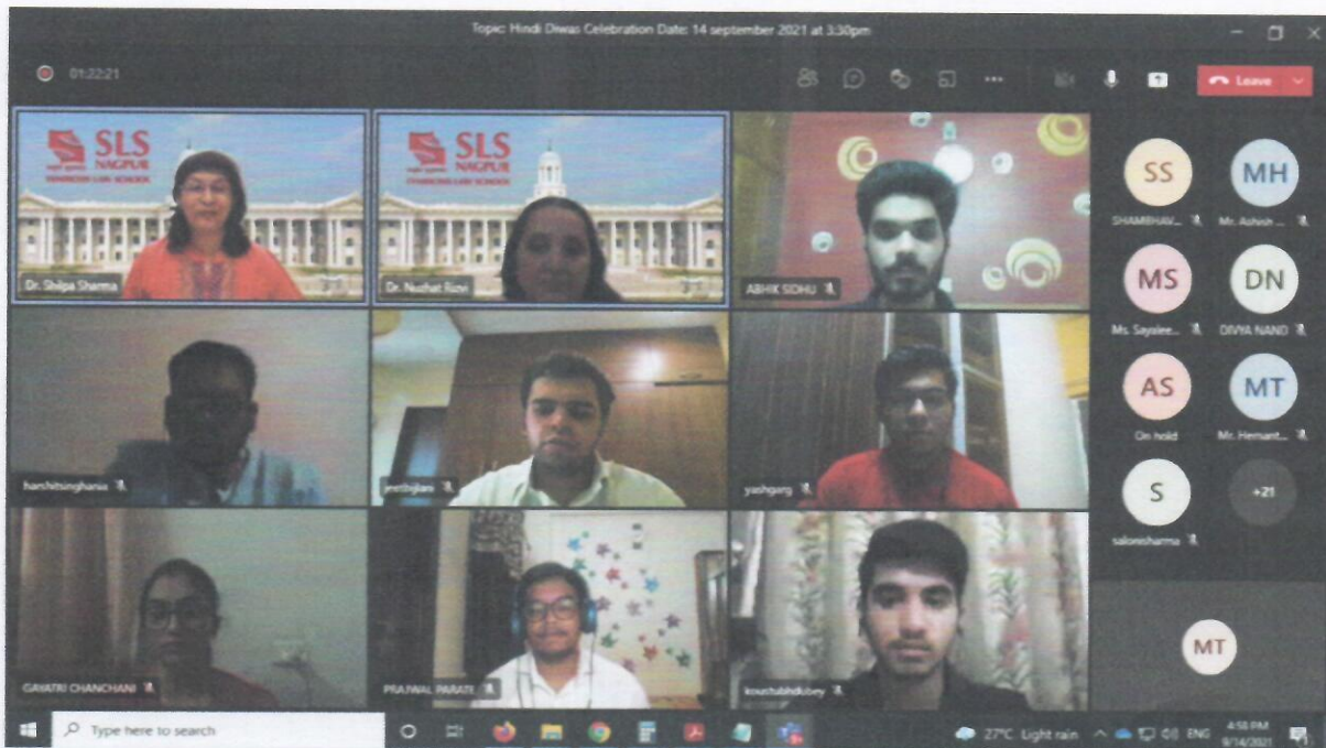
Group photograph taken during the program.